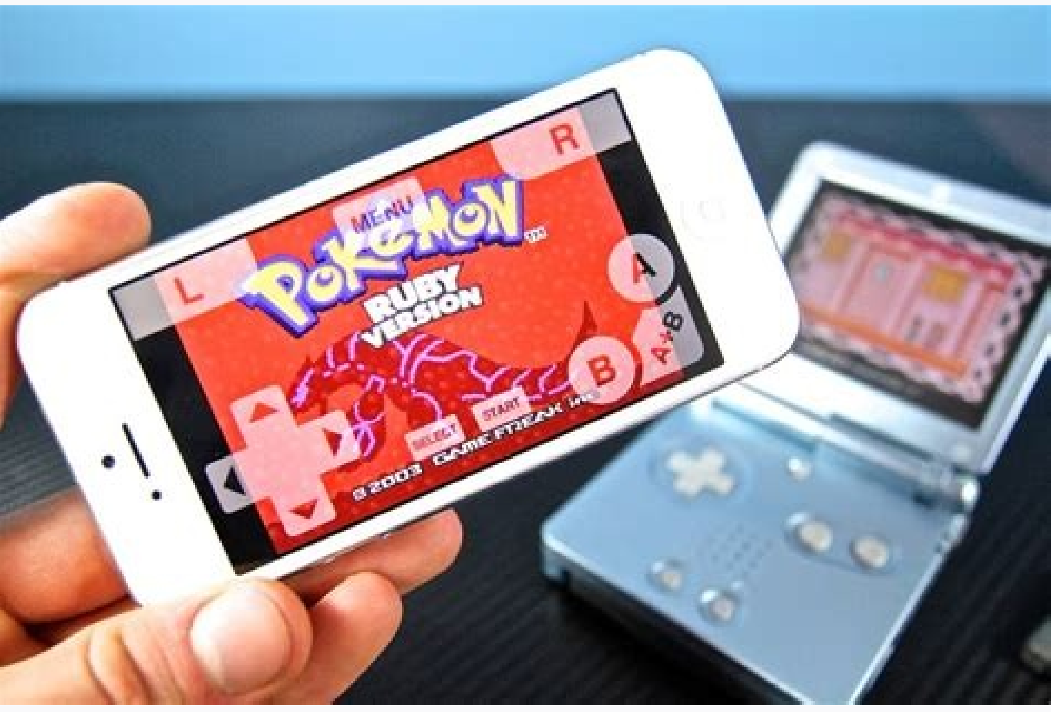
Can i play old pc games on android. Game roms for android phones. Games of pc for android. Best game roms for android. What pc games can i play on android.